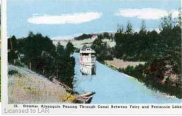
18. Steamer Algonquin Passing Through Canal Between Fairy and Peninsula Lakes Licensed to LAR