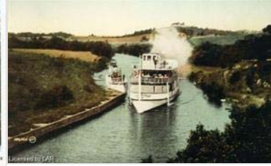
Licensed to LAR